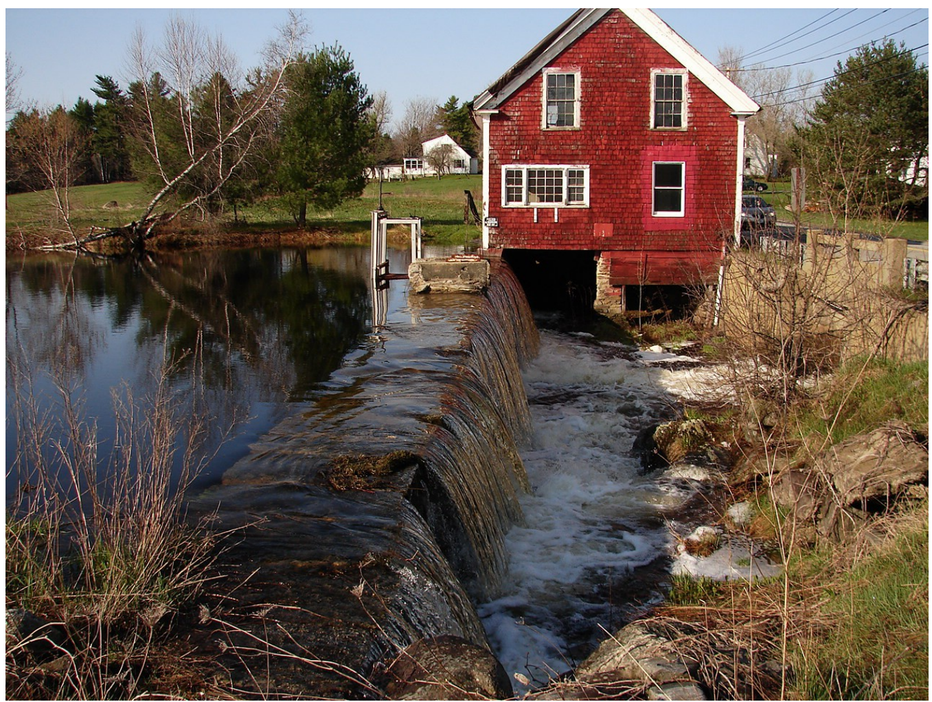
Illustration 2: This is not a flood event. This is routine over topping of the dam which is to be expected when the lake level is maintained at the Normal High Water Mark of the dam. Note the gate is wide open; total estimated flow is approximately 100 cfs. Photograph by George Fergusson April 30, 2008

Handling Flood Events There is nothing wrong with lake water flowing over the Clary Lake Dam. It was built for the purpose of impounding as much water as possible for use in the downstream mill, and the lake level since the dam's construction in 1903 has historically been maintained at or very close to the top of the dam for much of the time. It is unreasonable to assume the lake level could be maintained even near the top of the dam without having water routinely flowing over the top, and this explains why the Historical Normal High Water Mark (NHWM) of the lake was determined to correspond to the top of the dam. Since the WLO requires at ice-out in the Spring that the level of the lake be raised, as near as practicable to its full capacity (i.e., at the NHWM or top of dam) and be maintained there until August 1, lake