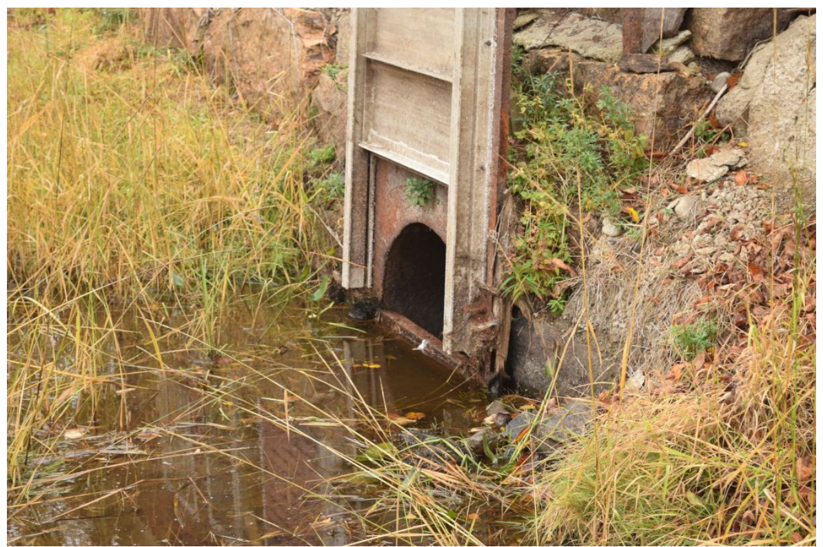
Illustration 1: Photograph of the Clary Dam gate showing the obstruction on the bottom. Photograph by George Fergusson 09 October 2017

The WLO provides gate openings (in decimal feet) calculated to release the required minimum flows. However, in the process of repairing the hole in the dam we installed a 5 foot wide weir which will be the primary means of managing the lake level. Consequently, the stated gate openings are not particularly helpful to us.